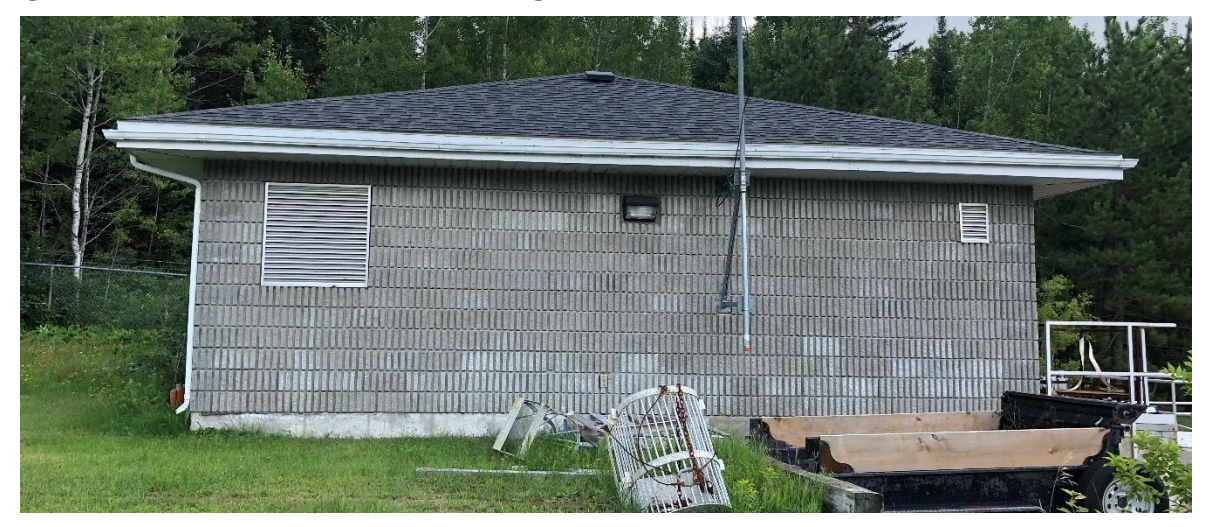
Figure 2-1 Waste Water Treatment Lagoon Site Photos